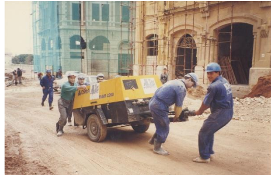
Beirut Central District (1995)

negotiations, contract administration, and the training and motivation of staff and engineers. Projects included real estate development, general contracting, turnkey design/build projects, highly specialized structural and historic rehabilitation projects.