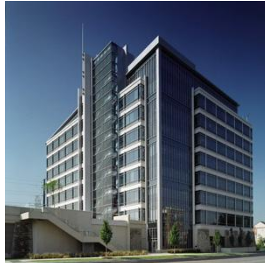
Sallie Mae Headquarters in Reston, VA