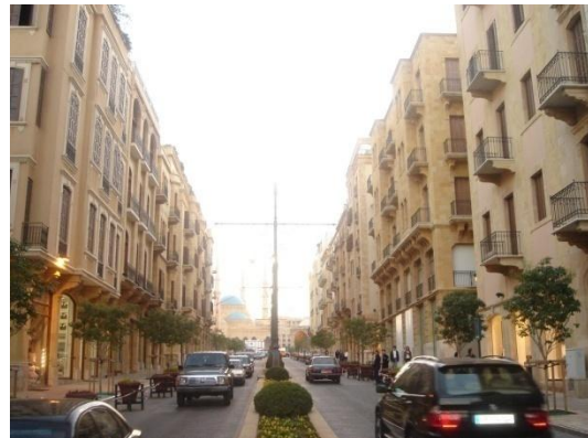
Beirut Central District (2000)