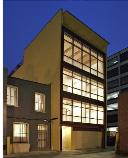
International Campaign for Tibet Headquarters Washington, DC

and the $65 million United States Pharmacopeia Headquarters Building Expansion.