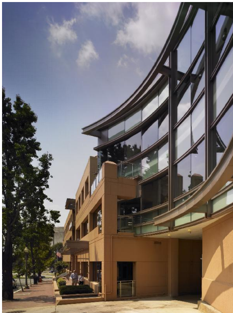
DNC Headquarters Washington, DC