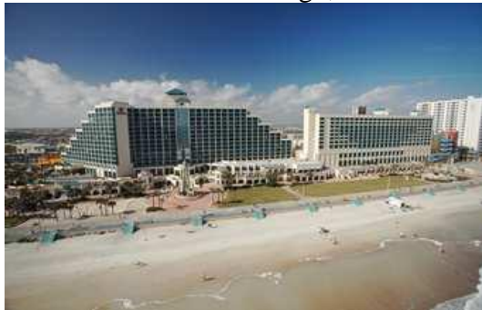
Adams Mark Daytona & UPMC Northwest