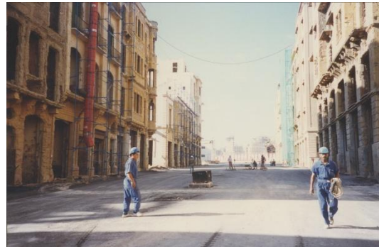
Beirut Central District (1997)